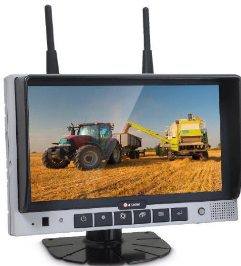
CRV 7044M AIR

7" TFT LCD monitor for up to 4 wireless cameras